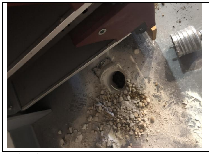
2. View of WHS630-1 sample area.