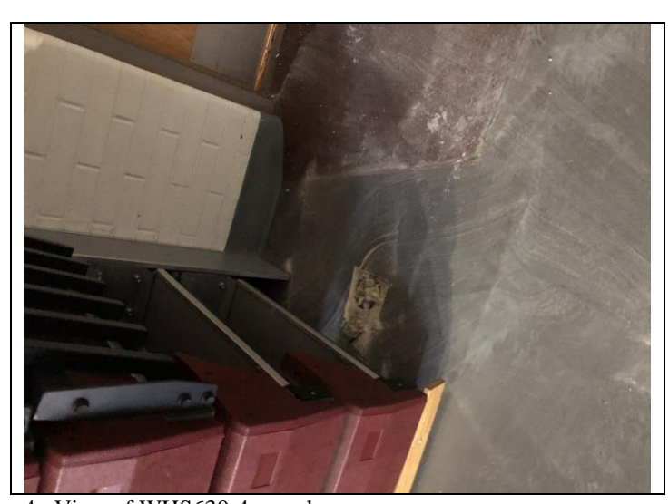
4. View of WHS630-4 sample area