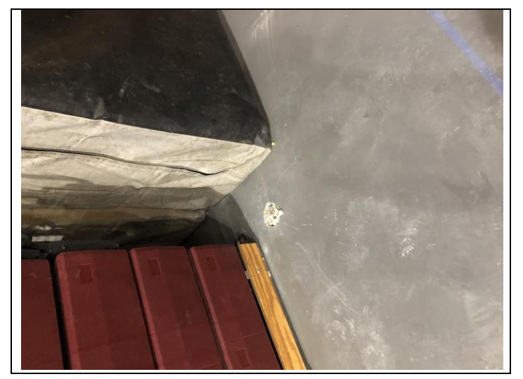
5. View of WHS630-10 sample area.