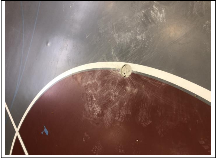
3. View of WHS630-13 sample area