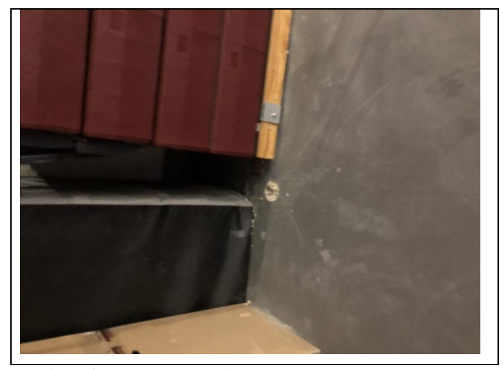
5. View of WHS630-7 sample area